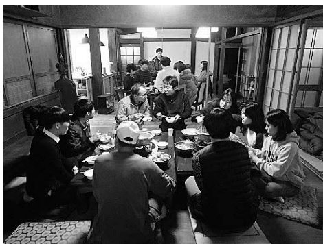
Eating a pot dish together

We made a pot dish of organic vegetables harvested by local farmers. The participants seemed to enjoy not only the meal itself but also the preparation, deepening a friendship during the process.