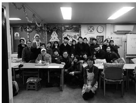
Fujimi, a day care center

After the visit of head office, we visited also one of its day-care center “Fujimi” in Itabashi city and one of its entrusted elderly welfare facilities “Yamabuki-cho chiiki-koryukan” in Shinjyuku city.