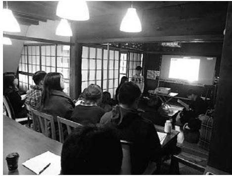
Japanese and Korean students giving presentations

an exchange of presentations with the titles “Aging and Low Fertility Problems In Korean Society”, “Job and Income Creation for the Elderly in Korea”, “LGBT Issues in Japan”, and “Job Hunting Activities of Japanese Students”.