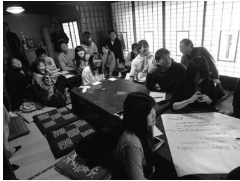
Presentation time after discussion