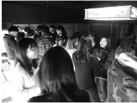
Japanese and Korean students engage in an icebreaking activity

trust and friendship. The participants were instructed to approach to as many peers of different nationality as possible and ask different questions to find things that both had in common such as hobbies, pets, interests etc. and at the same time to remember the persons' names.